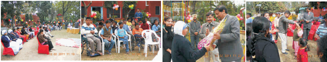
KSF and Hash Biotech Labs's staff with Children of Mother Teresa Missionaries of Charity, Chandigarh